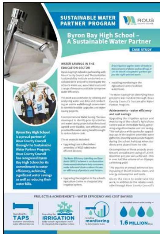
Figure 2: Example case study, Byron Bay High School.