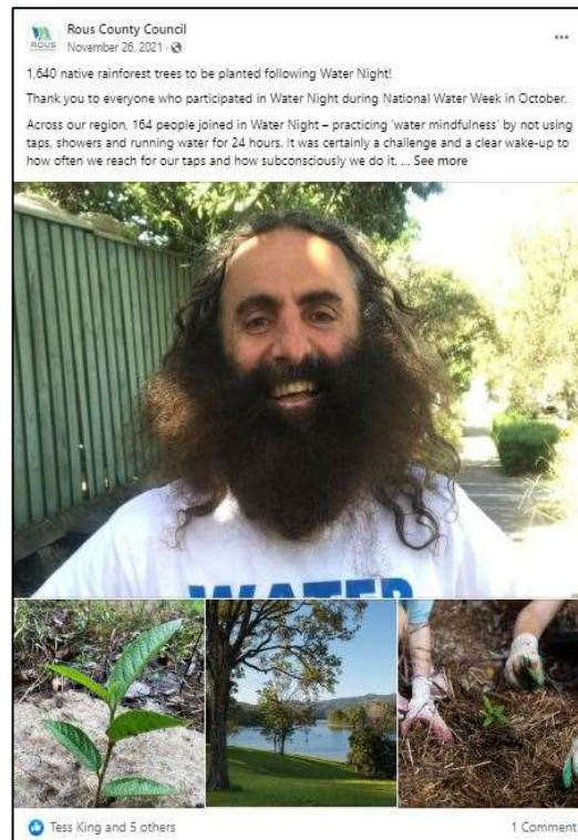
Figure 4: Social media example.